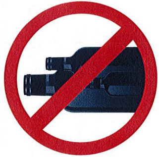
Glass of any kind